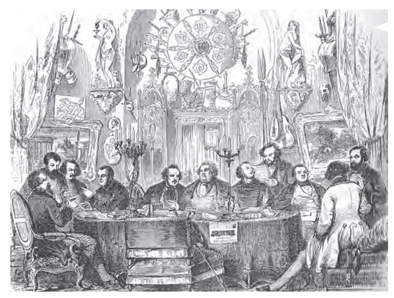
Bureau de la Rédaction du journal Illustration - Journal Universel, (Illustration - Journal Universel, 1844, 9)

Du Sommerard and Sauvageot chose a multiplicity of objects of different era's, places and styles and brought them together in their domestic interior. By doing this they did not destroy nor mutilate the authenticity of the chosen artifact. Their collections didn't pretend syncretism. They were not looking for aesthetic harmony in the unity of style in their interior. On the contrary, every object had its special value and had to maintain its relative autonomy. Judging by the descriptions of the interiors of the collectors in most of the popular middle-class journals depictured as treasure-houses, the characteristics of the remarkable objects, the social and artistic commitment, the calculated accumulation of artifacts and the choice based on scien-