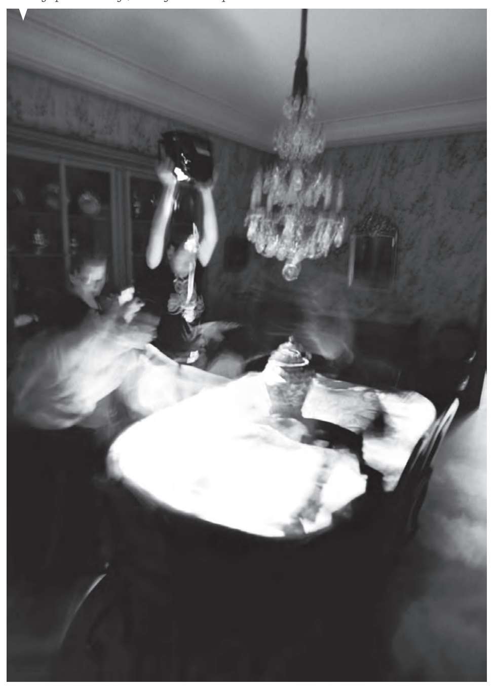
'Schliessen sie mir das Kleid danke/Close my dress, thank you', Villa Langmatt, Switzerland.