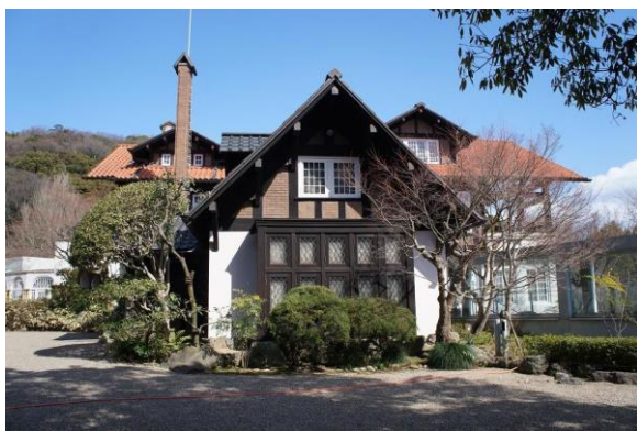
Asahi Beer Oyamazaki Villa Museum of Art