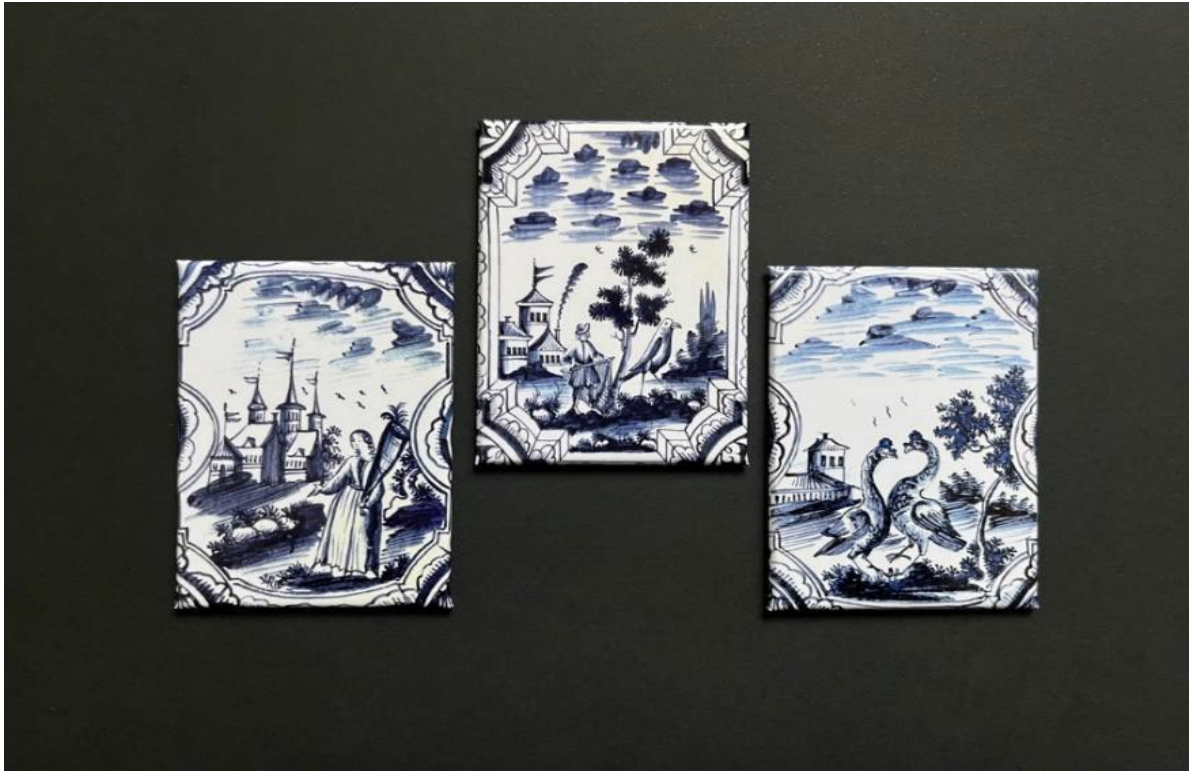
Magnets: “Woman with a cornucopia”, “Hunting scene”, “Cockfight”

Initially, the grant was allocated for the printing of postcards but as the costs proved to be less than expected, we received the permission from DEMHIST secretary to use the rest of the allocation for the printing of magnets. Together it sums up to EUR 673.37.