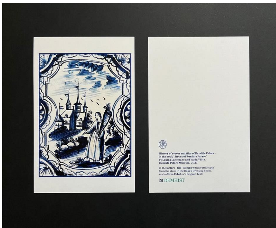
Postcard with a picture of a stove tile “Woman with a cornucopia” from the stove in the Duke’s Dressing Room, work of Ivan Ushakov’s brigade, 1738